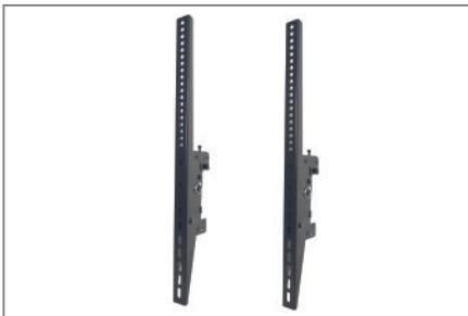
VESA max. 400 x 600 mm

The complete solution can be combined and extended with the components of the comPROnents® series without restriction and thus offer further application possibilities.