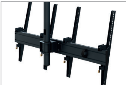
Adaptable thanks to modular design